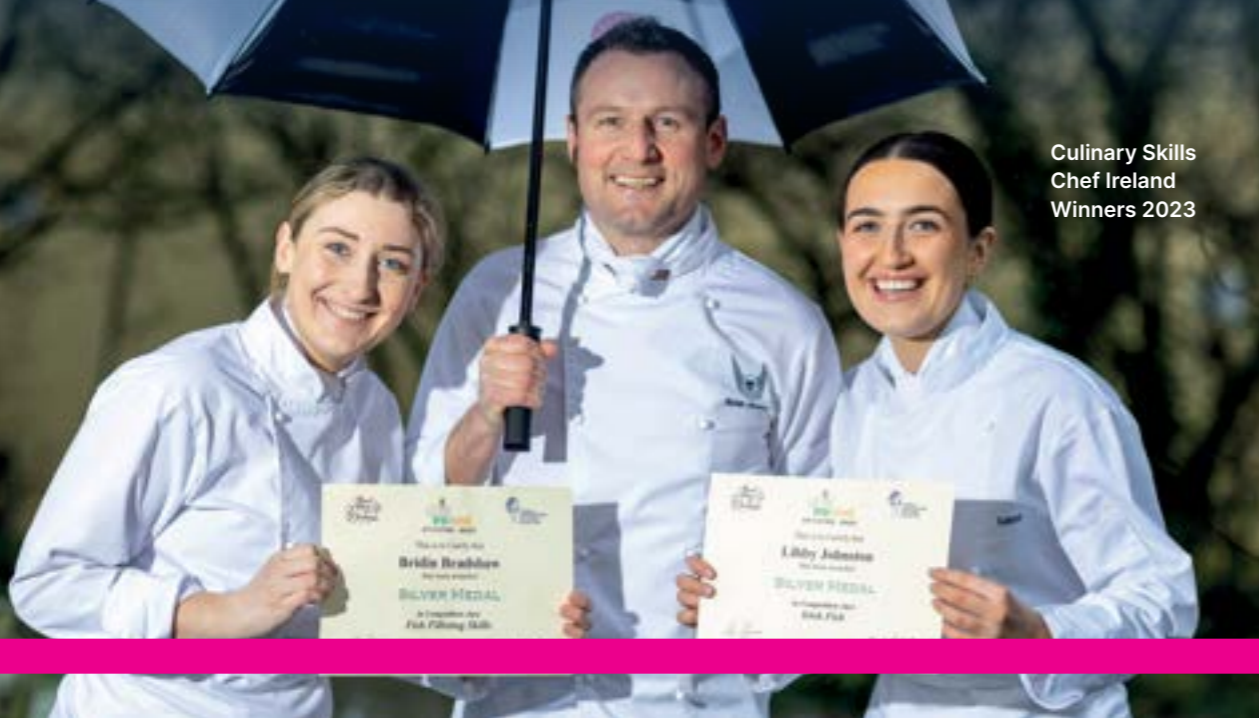
Culinary Skills Chef Ireland Winners 2023

The Bachelor of Commerce (BComm) prepares students for a career in business management in the hotel industry and also provides an opportunity to specialise in a business discipline in the final academic year.