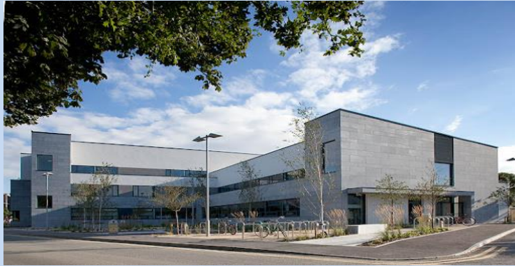
School of Psychology building on the main campus

We're really looking forward to meeting you all and being a part of your important first-year journey at University of Galway. We want to make sure that your experience of studying Psychology is rich and rewarding, and we also realise that your physical and psychological wellbeing is extremely important; please know that we're available to support you throughout the year, so keep in touch with us, whether you have a question about the course or you're feeling overwhelmed (we've met students with so many different challenges and circumstances over the years, so you're not going to shock or bother us in any way).