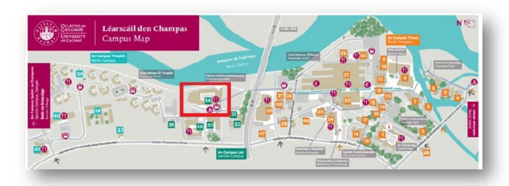
Figure 1: 34: Alice Perry Engineering Building