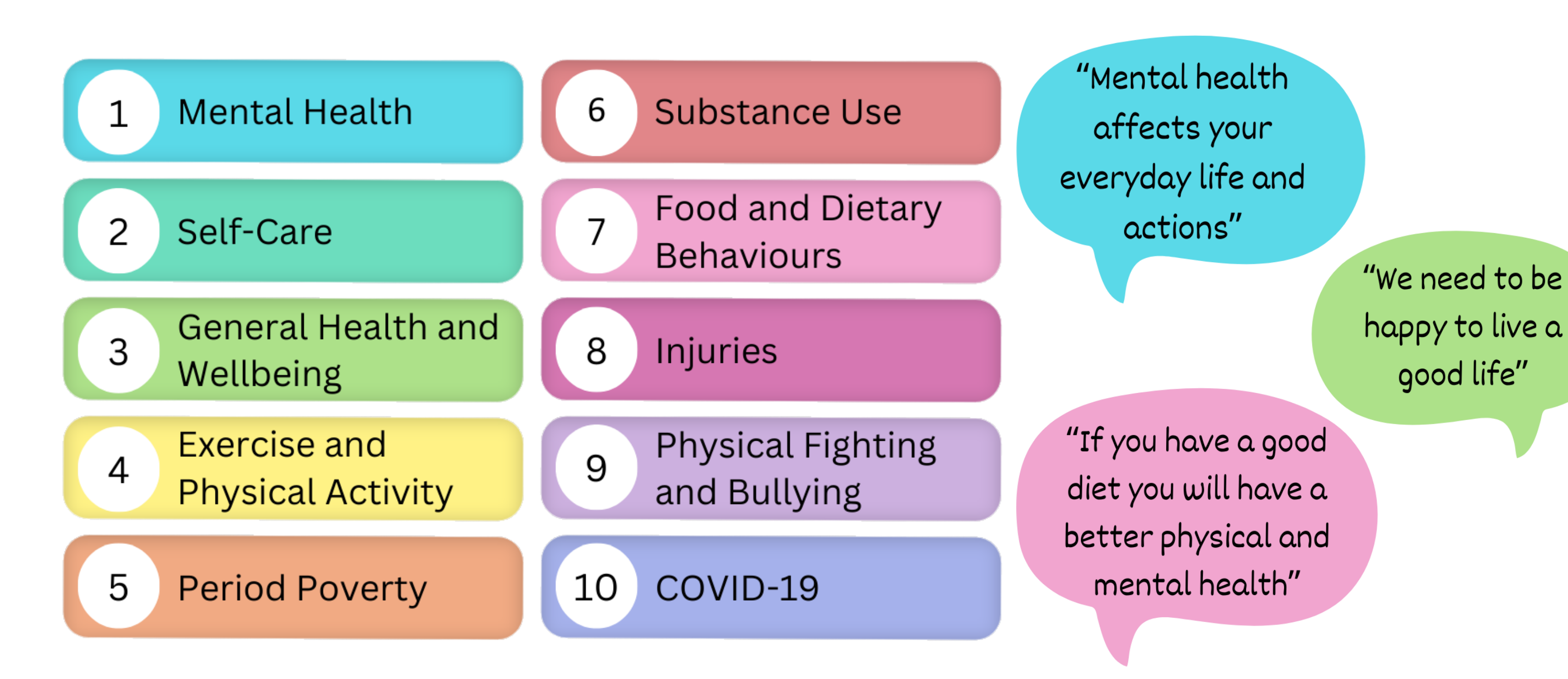
Figure 1: Students' ranking of priority topics for inclusion in the HBSC Ireland 2022 National Report

The HBSC Ireland study is funded by the Department of Health. Thank you to the young people who shared their valuable insights.