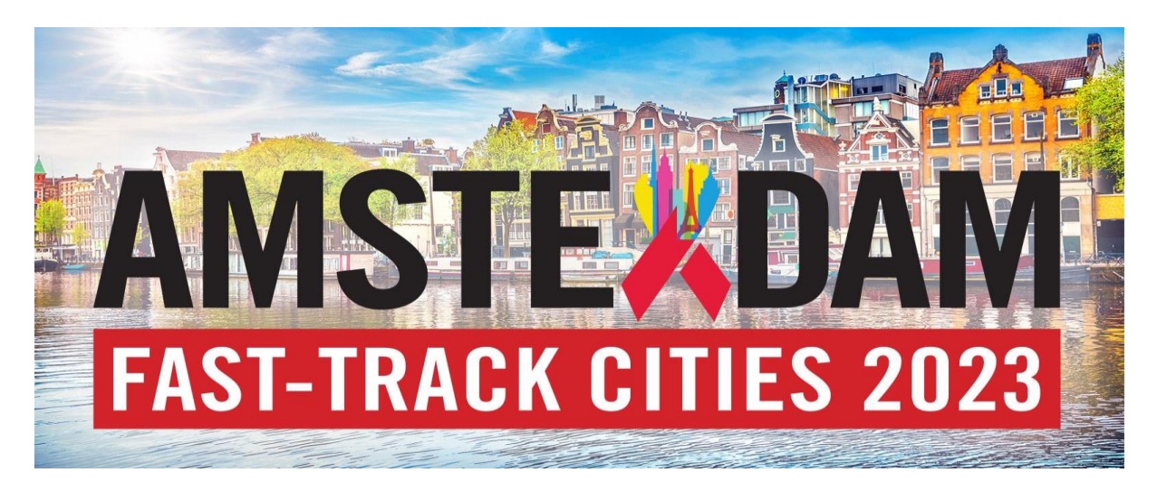
Fast Track Cities Conference – Amsterdam

The commissioned research company are continuing to analyse the data, and will shortly begin drafting chapters. A study advisory group was established when the research company was commissioned, consisting of representatives from the city Steering Groups. The study advisory group is overseeing the progression of the scoping study and will provide input and feedback on draft chapters as they come through