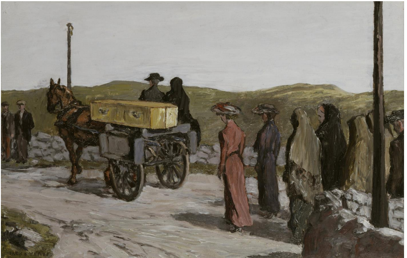
Jack B. Yeats (1871-1957), 'The Swinford Funeral'