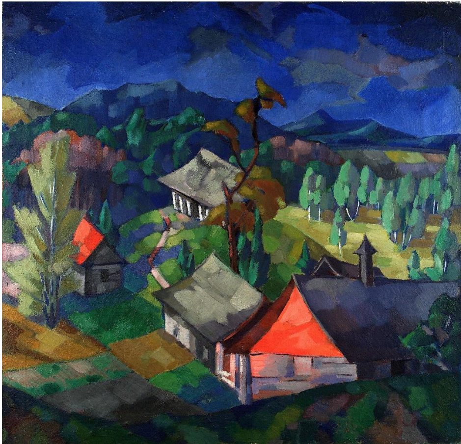
Konrad Mägi (1878-1925), Lake Saadjärv Landscape, 1923

Students who need supports with writing skills should avoid platforms such as Quillbot, which have GenAI modes, unless directed otherwise by their lecturer. Instead, contact the University's Academic Writing Centre (AWC), which is located in the James Hardiman Library, Floor 2. For further information, click on the following: https://library.universityofgalway.ie/studying/awc/