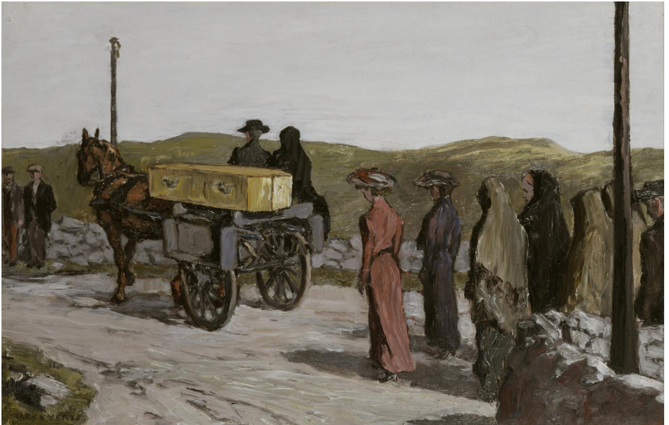
Jack B. Yeats (1871-1957), 'The Swinford Funeral'