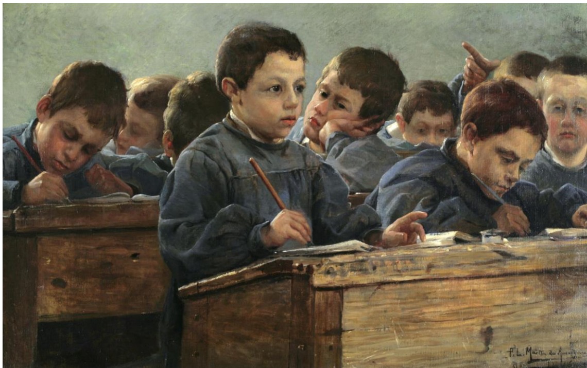
Paul Louis Martin des Amoignes (1858–1925), 'In the Classroom'

Descriptions of the modules, including details of assessment requirements, are on the following pages.