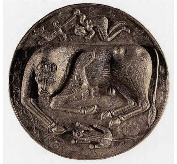
BULL SACRIFICE, GUNDESTRUP CAULDRON, DENMARK