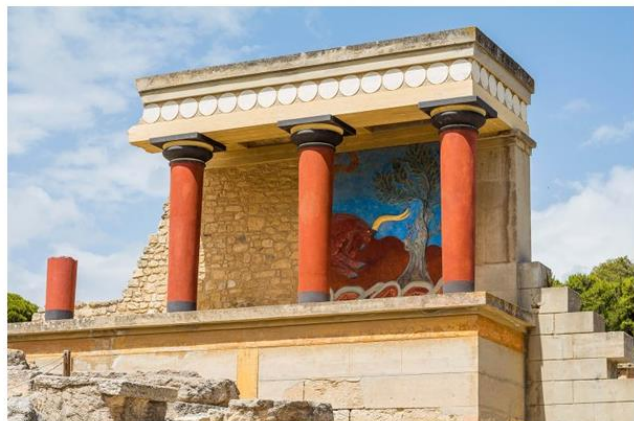
Bronze Age palace of Knossos on Crete

The European Bronze Age was characterized by unprecedented population growth, the emergence of more hierarchical societies, the expansion of trade and exchange, competition and warfare between relatively small polities, and the accumulation of wealth by those at the apex of societies. All these phenomena that first became prominent in this formative period in Europe's past have continued to shape the trajectory of European history ever since, all