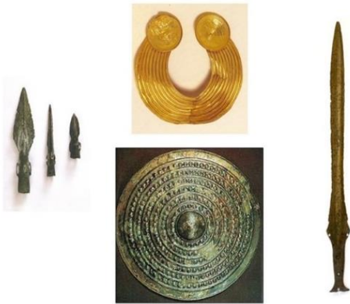
Irish Bronze Age high-status ornamentation and weaponry

the way to our modern era. The story of the European Bronze Age is a story spread out over roughly two and a half millennia and across landscapes ranging from sunny Mediterranean shores to chilly Nordic mountains, and from Atlantic islands in the west to the vast eastern steppes that merge into the Asian continent. In this class we journey through these centuries and across these landscapes using the discoveries of archaeologists and other scholars and scientists to better understand this ancient and yet very influential period in Europe's past.