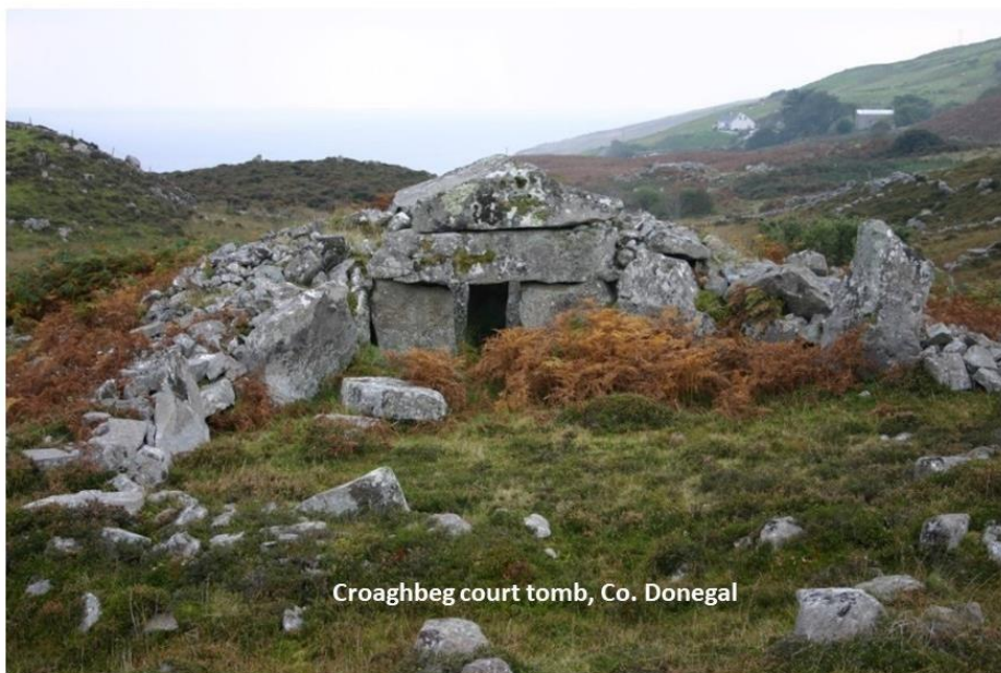
Croaghbeg court tomb, Co. Donegal

This course is an introduction to the prehistoric communities who inhabited Ireland, Europe and Western Asia from about 150,000 BC to AD 400. Archaeologists divide this long period of time into the Palaeolithic (Old Stone Age), Mesolithic (Middle Stone Age), Neolithic (New Stone Age), Bronze Age and Iron Age. We begin with the earliest modern human inhabitants of Europe and Western Asia, their hunter-gatherer way of life, their art and their relationship to the Neanderthal communities who preceded them. We look at evidence for the first hunter-gatherers who settled in Ireland and later the settlements and rituals of the first communities to develop agriculture and build megalithic tombs. We move on to examine changes in how these communities organised themselves and their rituals over thousands of years, including their adoption of bronze and iron metalworking.