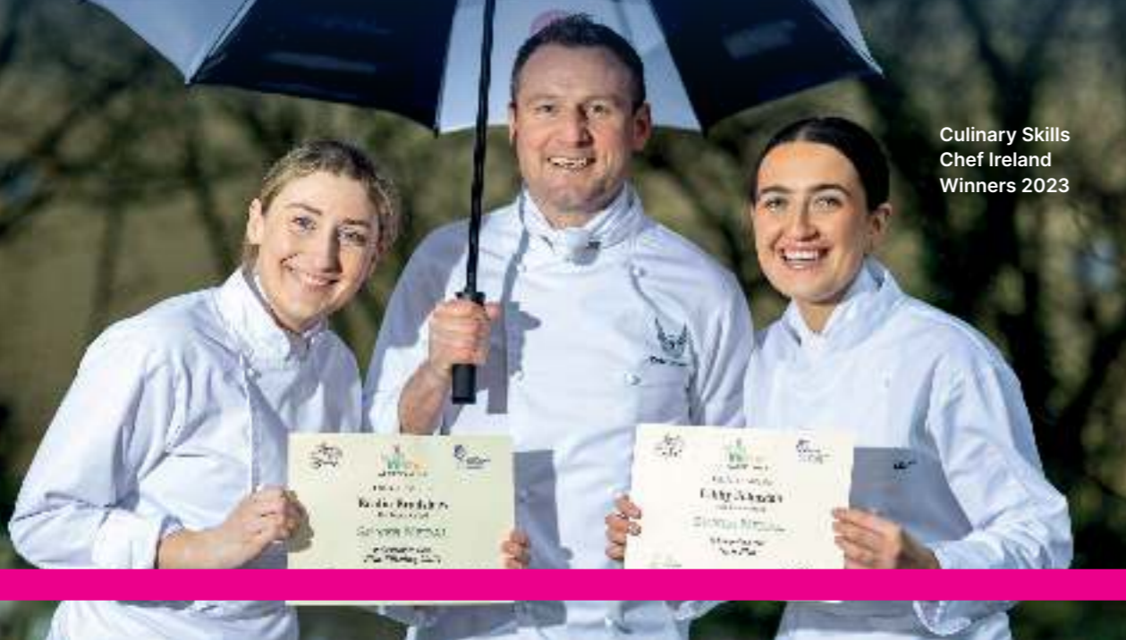
Culinary Skills Chef Ireland Winners 2023

The Bachelor of Commerce (BComm) prepares students for a career in business management in the hotel industry and also provides an opportunity to specialise in a business discipline in the final academic year.